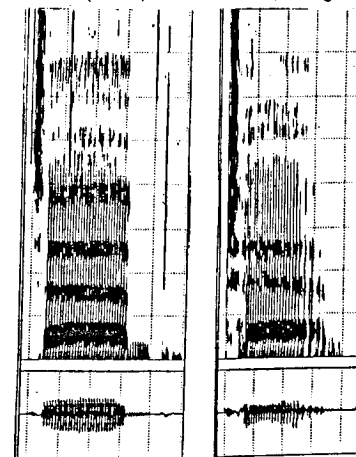
Figure 3. Spectrograms of the word /t/ in Arabic (left) and in English (right) produced by Arabic learners of English.

- The mean VOT values of the Arabic learners of English vary as a function of the target language: a long-lag VOT (51ms) for English /t/ and a short-lag VOT (29ms) for Arabic /t/ (see figure 3).